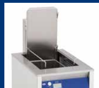
Hot air dryer