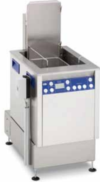
Single unit with oscillation device