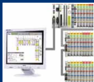
Operating panel designed as touch panel