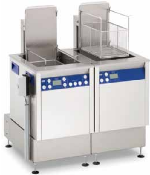
Manual 2-chamber system with oscillation device